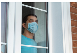
PEOPLE ON QUARANTINE MONITORING